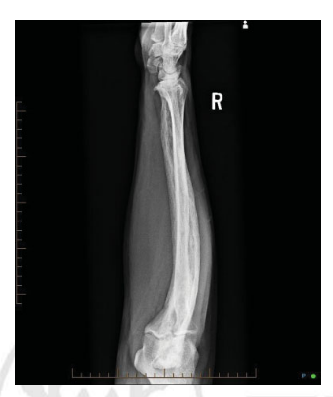
Fig. 3 Plain radiograph of the patient's forearm ( lateral view ) at presentation. Ulnar hypertrophy is appreciated from a different angle in this view.