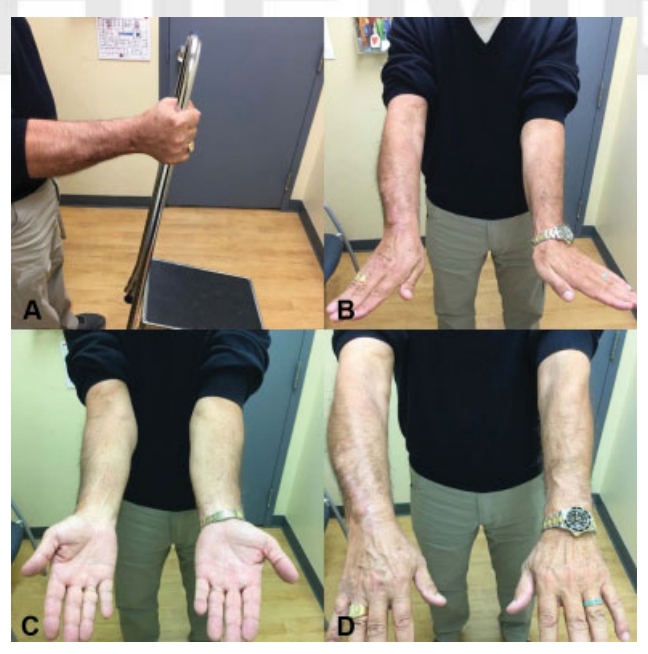
Fig. 6 (A) Two-year follow-up showing satisfactory stress loading. (B) Two-year follow-up demonstrating satisfactory ulnar deviation. (C) Two-year follow-up demonstrating satisfactory supination. (D) Two-year follow-up demonstrating satisfactory pronation.

patient's entire ulna was affected by PDB, his history and physical exam were consistent with pain from these two secondary wrist conditions, which prompted him to elect for surgical rather than medical management.