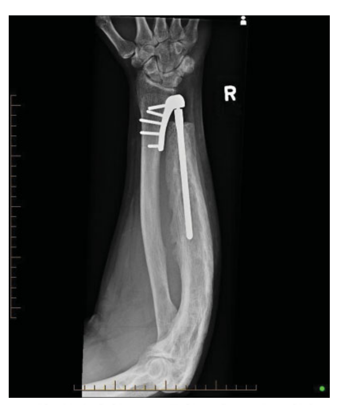
Fig. 4 Plain radiograph which showcases successful semiconstrained DRUJ arthroplasty in this patient ( AP view ). AP, anteroposterior; DRUJ, distal radioulnar joint.

to be a more painful condition prompting surgical intervention as demonstrated by this patient's secondary conditions of ulnocarpal impaction and DRUJ arthropathy. Although this