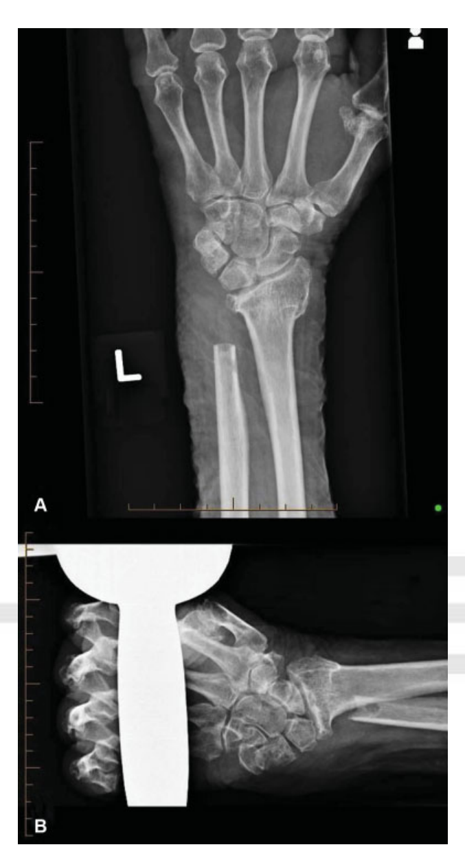
Fig. 8 (A) PA radiograph of the wrist status postulnar head resection, displaying an ulna osteotomy prone to ulnar impingement syndrome. (B) Radiograph stress view demonstrating ulnar impingement syndrome with ulnar loading. PA, posteroanterior.

Our review of the literature does not provide guidelines for the management of this specific patient with ulnar wrist pathology related to PDB. There is, however, a large body of literature regarding the surgical management of his secondary conditions, particularly in the setting of primary osteoarthritis and rheumatoid arthritis.<sup>2,3</sup> Traditionally, many surgeons have favored the Darrach or SK salvage procedures to address this type of ulnar wrist arthropathy. Some advantages of these procedures are the potential for long-term good clinical outcomes, including improved forearm range of motion without the need for arthroplasty implants, which could lead to painful loosening or may not be available, particularly in certain parts of the world. The major known disadvantage of the Darrach and SK procedures is the progression of distal ulnar impingement syndrome and instability, which causes significant pain.<sup>5</sup> Dynamic distal ulnar impingement after a Darrach procedure can be demonstrated radiographically with an ulnar loading stress view (>Fig. 8). To abate this problem, some surgeons prefer primary or secondary Achilles tendon allograft interposition arthroplasty, which has demonstrated fair to good results in certain hands.<sup>6</sup> Other surgeons have preferred primary or secondary use of the distal ulnar head endoprosthesis DRUJ hemiarthroplasty. These authors, with a relatively large