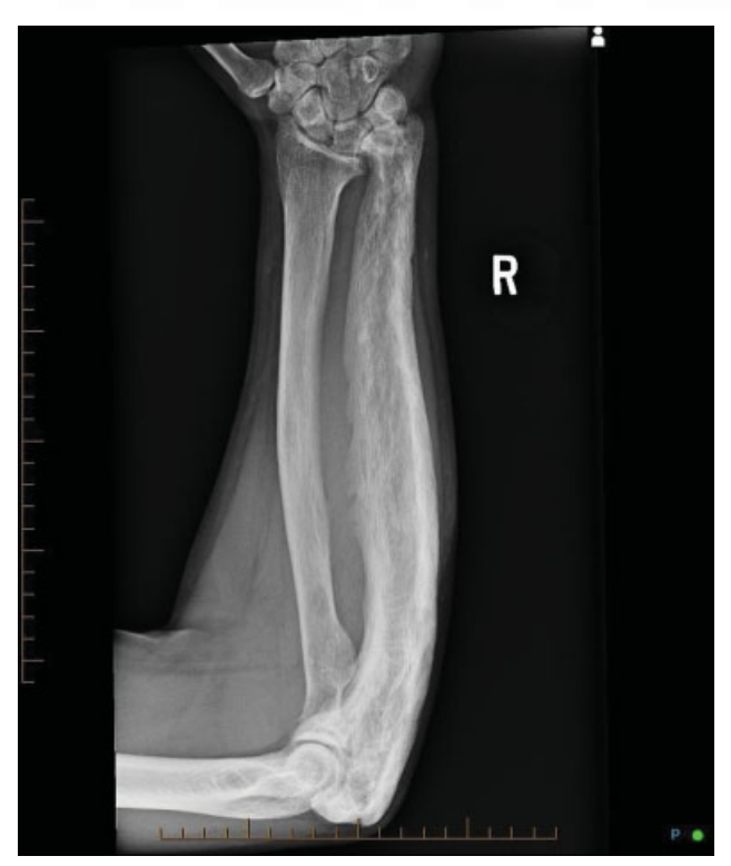
Fig. 2 Plain radiograph of the patient's forearm ( AP view ) at presentation. Demonstration of the patient's Paget's disease of the ulna with severe osseous sclerosis and hypertrophy—characteristic of PDB—seen here. AP, anteroposterior; PDB, Paget's disease of bone.

The novelty of this case lies in the patient's decision to elect for surgical management, rather than medical treatment, of his PDB-induced DRUJ arthropathy. Furthermore, his decision to opt for semiconstrained linked TDRUJA over other surgical options and his excellent clinical outcome, as compared with outcomes after other options reviewed in the literature, are what makes this case unique. PDB by itself is often a painless or mildly painful disease process, consistent with this patient's history of low-grade pain of 20 years' duration without a diagnosis of PDB during this period. In general, bone pain related directly to PDB can be managed medically with bisphosphonates. However, PDB-related arthropathy appears