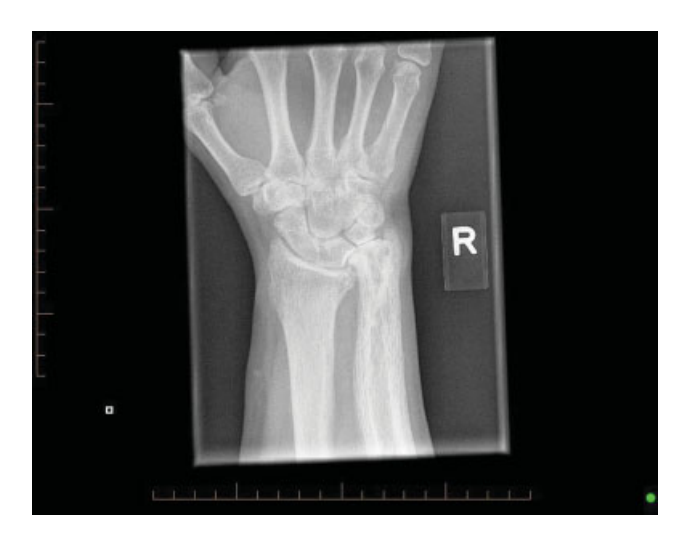
Fig. 1 Plain radiograph of the patient's wrist ( PA view ) at presentation. DRUJ arthropathy and ulnocarpal impaction are best visualized here. DRUJ, distal radioulnar joint; PA, posteroanterior.

A 65-year-old right-hand-dominant retired male presented with chronic right ulnar-sided wrist pain of 20-year duration, which became disabling. He had severe pain with activities of daily living and fishing, his most passionate hobby. He also noticed a limited range of motion of his wrist and forearm compared with his nondominant hand. This limited range of motion had been long-standing since his teenage years. However, it never bothered him enough to seek medical attention until recently. He had no history of trauma nor a significant past medical or family history of orthopedic conditions. On physical exam, he had marked wrist asymmetry, notably from the right-sided distal ulnar prominence dorsally with limited, painful ulnar deviation of 5 degree (contralateral 30 degree).