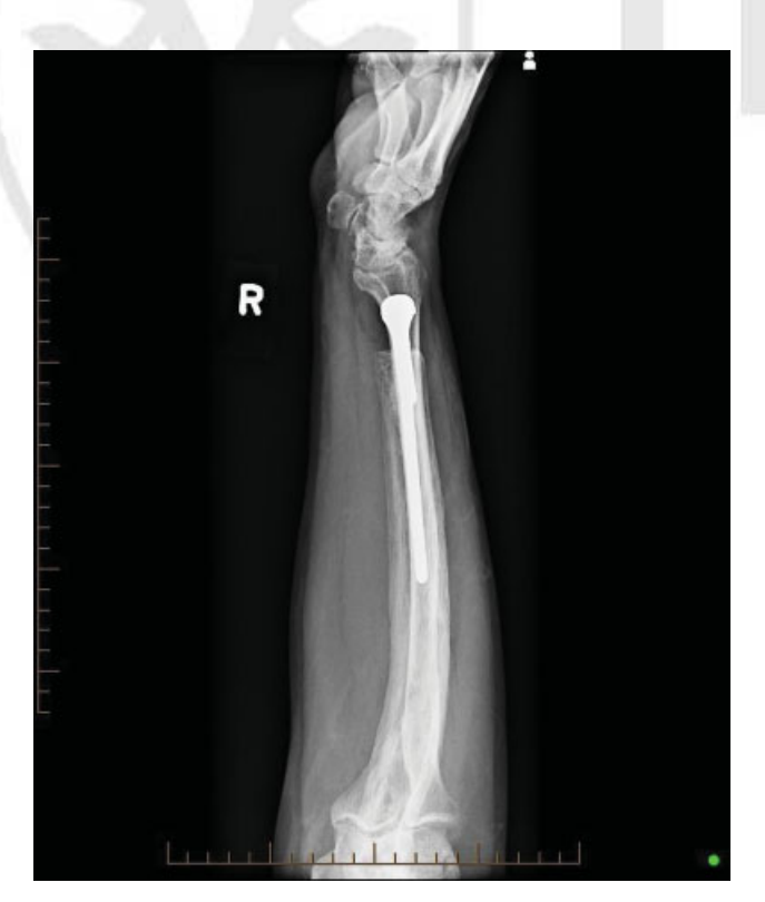
Fig. 5 Plain radiograph demonstrating another view of successful TDRUJA placement ( lateral view ). TDRUJA, total distal radioulnar joint arthroplasty.

to be a more painful condition prompting surgical intervention as demonstrated by this patient's secondary conditions of ulnocarpal impaction and DRUJ arthropathy. Although this