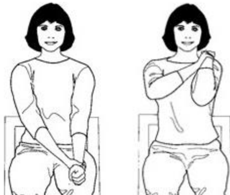
Passive Elbow range of motion exercises