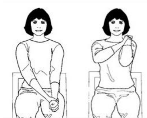
Passive Elbow range of motion exercises